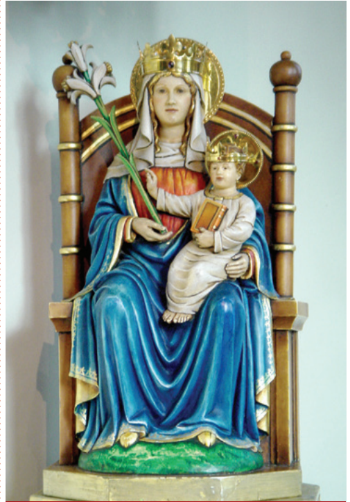
Our Lady of Walsingham

In more recent times, the Legion of Mary has led the way for acceptance of the role of the laity in the Vatican Council and continues to make a remarkable contribution for laity to find a place in the life of the church. All it needs to succeed is for clergy to continue to accept and support its desire to serve the parish community and to express it in service to Mary's mothering of her son Jesus in all the elect.