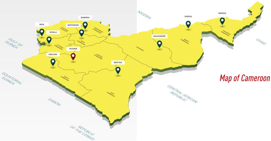
Map of Cameroon

In 2002, seeing the immense work that the Regia was doing through the reports drawn up by the Regia Mediatrix of all Graces of Douala, the Concilium decided to erect Douala into a Senatus.