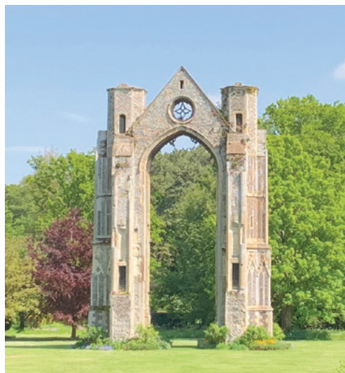
Remains of the 11th century Holy House of Nazareth

This places the event in the reign of one of the last Anglo-Saxon Kings, Edward the Confessor, who reigned from 1042 to 1066. King Richard II, in 1381, formally dedicated England to Mary in a ceremony at Westminster Abbey. Until the Protestant Reformation, many kings of England continued this devotion to Mary—including Henry V, who supposedly raised the battle cry at Agincourt: "Our Lady for her Dowry; St. George and St. Edward to our aid."