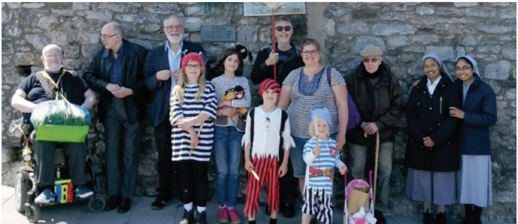
The young pirates and the Cathedral Sisters at our openair Sunday Rosary in May.

Those who couldn't attend were invited – via notices in our City parishes – to recite five Mysteries of the Rosary in their own homes at the same time. So together, we were able to commend all those who were suffering in mind or body, war or poverty, to the loving care of our Holy Mother Mary.